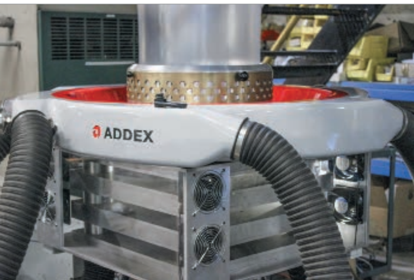
Addex's ICE unit is mounted between the die and air ring; the cooling elements are surrounded by an enclosure to improve bubble stability.